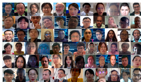
ICMHI 2020 | 2020.8.14-16 VIRTUAL CONFERENCE

ICMHI 2021 papers were published in ACM Proceeding, ISBN: 978-1-4503-8984-6, and indexed by Ei Compindex and Scopus successfully.