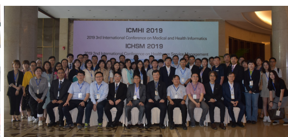
ICMHI 2019 | 2019.5.17-19 XIAMEN, CHINA

ICMHI 2020 papers were published in ACM Proceeding, ISBN: 978-1-4503-7776-8, and indexed by Ei Compindex and Scopus successfully.