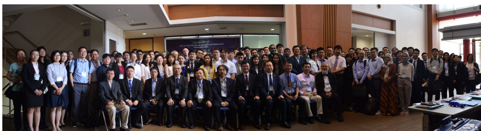
ICMHI 2018 | 2018.6.8-10 TSUKUBA, JAPAN

ICMHI 2019 papers were published in ACM Proceeding, ISBN: 978-1-4503-7199-5, and indexed by Ei Compindex and Scopus successfully.