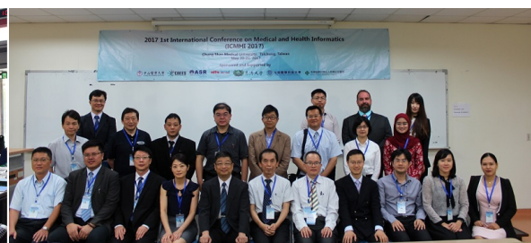
ICMHI 2017 | 2017.5.20-22 TAICHUNG, TAIWAN

ICMHI 2018 papers were published in ACM Proceeding, ISBN: 978-1-4503-6389-1, and indexed by Ei Compindex and Scopus successfully.