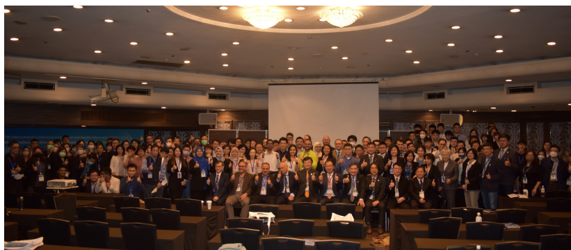
ICMHI 2023 | 2023.5.11-14 KYOTO, JAPAN

ICMHI 2023 papers will be published in ACM Proceeding, ISBN: 979-8-4007-0071-2, and will be indexed by Ei Compindex and Scopus.