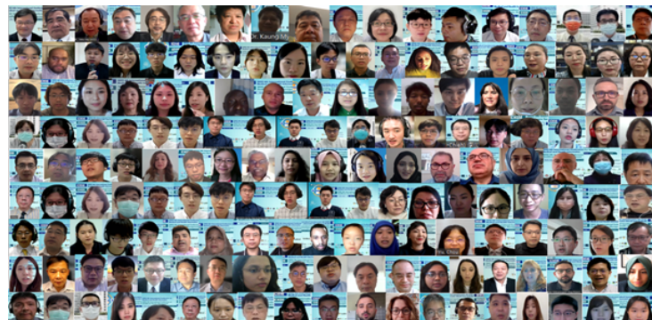
ICMHI 2022 | 2022.5.13-15 VIRTUAL CONFERENCE

ICMHI 2023 papers will be published in ACM Proceeding, ISBN: 979-8-4007-0071-2, and will be indexed by Ei Compindex and Scopus.