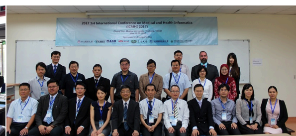
ICMHI 2017 | 2017.5.20-22 TAICHUNG, TAIWAN

ICMHI 2018 papers were published in ACM Proceeding, ISBN: 978-1-4503-6389-1, and indexed by Ei Compindex and Scopus successfully.