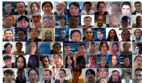
ICMHI 2020 | 2020.8.14-16 VIRTUAL CONFERENCE

ICMHI 2021 papers were published in ACM Proceeding, ISBN: 978-1-4503-8984-6, and indexed by Ei Compindex and Scopus successfully.