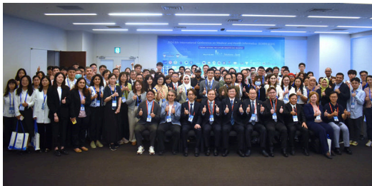
ICMHI 2024 | 2024.5.17-19 YOKOHAMA, JAPAN

ICMHI 2024 papers will be published in ACM Proceeding, ISBN: 979-8-4007-1687-4, and will be indexed by Ei Compindex and Scopus .