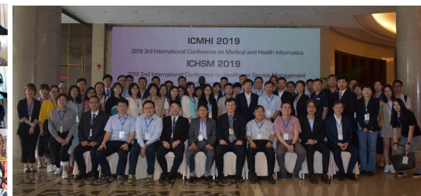
ICMHI 2019 | 2019.5.17-19 XIAMEN, CHINA

ICMHI 2020 papers were published in ACM Proceeding, ISBN: 978-1-4503-7776-8, and indexed by Ei Compindex and Scopus successfully.