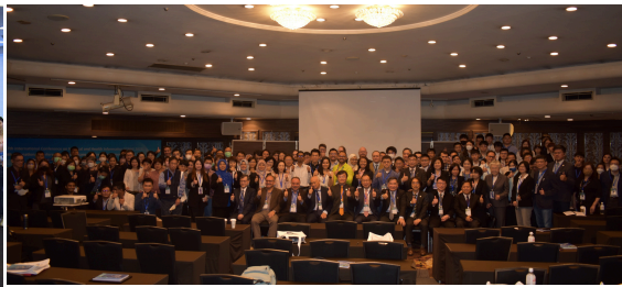
ICMHI 2023 | 2023.5.11-14 KYOTO, JAPAN

ICMHI 2024 papers will be published in ACM Proceeding, ISBN: 979-8-4007-1687-4, and will be indexed by Ei Compindex and Scopus .