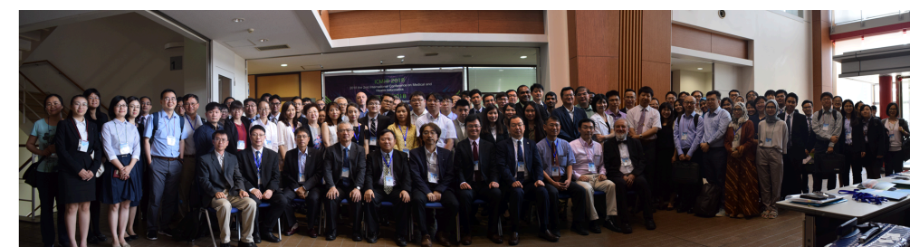
ICMHI 2018 | 2018.6.8-10 TSUKUBA, JAPAN

ICMHI 2019 papers were published in ACM Proceeding, ISBN: 978-1-4503-7199-5, and indexed by Ei Compindex and Scopus successfully.