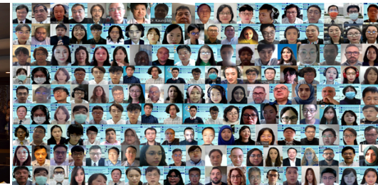
ICMHI 2022 | 2022.5.13-15 VIRTUAL CONFERENCE

ICMHI 2023 papers were published in ACM Proceeding, ISBN: 979-8-4007-0071-2, and indexed by Ei Compindex and Scopus successfully.